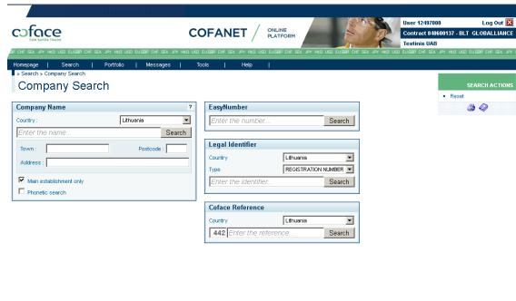
Fig. 2: Search for a specific company or check your customer's credit limit online.