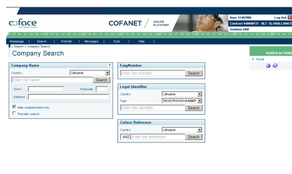
Fig. 2: Search for a specific company or check your customer's credit limit online.